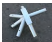
Half Crown AT