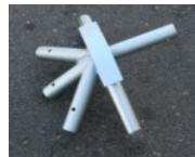
Half Crown AT