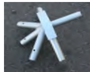
Half Crown AT