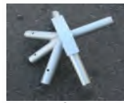
Half Crown AT