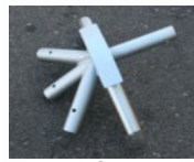
Half Crown AT