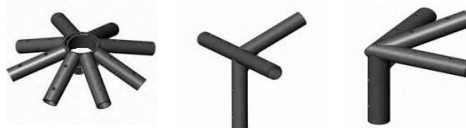
8 Way Crown Regular T Corner

Pre-Site Inspection- Call your local utility companies prior to installation for any underground obstructions.