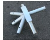
Half Crown AT